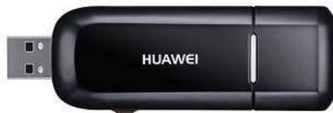
Figure 1-1 E1820 profile

Figure 1-1 shows the profile of the E1820.